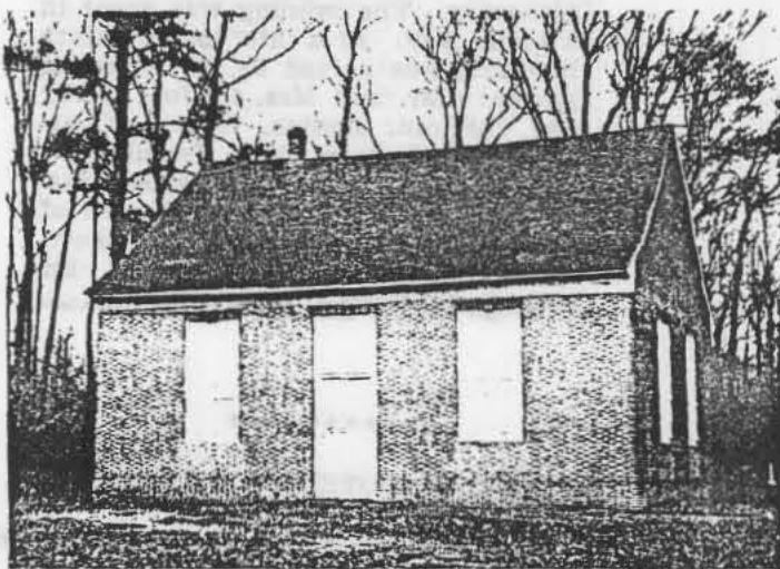
St. Martin's Church ... restoration plans aided by $40,000 grant.

Responsibility for the restoration and operation of the project is being taken over by a newly established trust, The St. Martin's Church Foundation, Inc. The foundation is being deeded this historic property by St. Paul's Episcopal Church, Berlin.