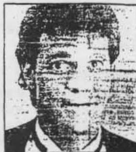
JOE PISCOPO To host 'Comic Strip Live'

"I'm supposed to do eight minutes on the show tonight, and originally it was going to be stuff I intended to do on Letterman or Carson later on," he